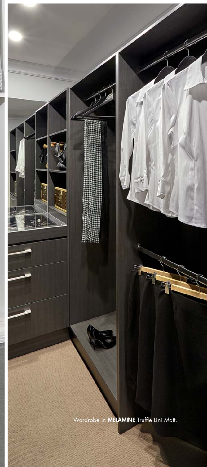
Wardrobe in MELAMINE Truffle Lini Matt.