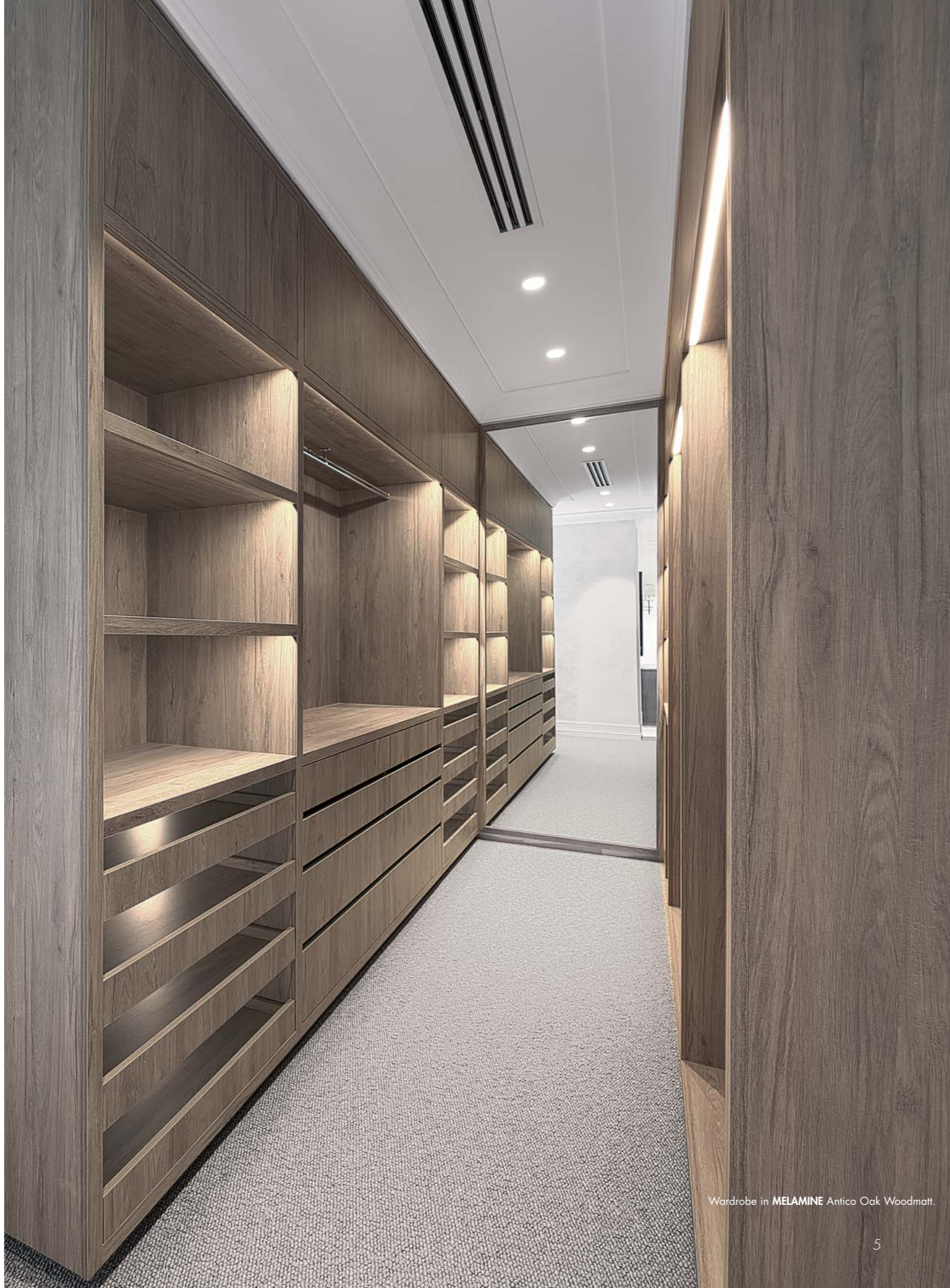
Wardrobe in MELAMINE Antico Oak Woodmatt.

Darker colours will show superficial wear and tear more readily than lighter coloured surfaces and require more care and maintenance.