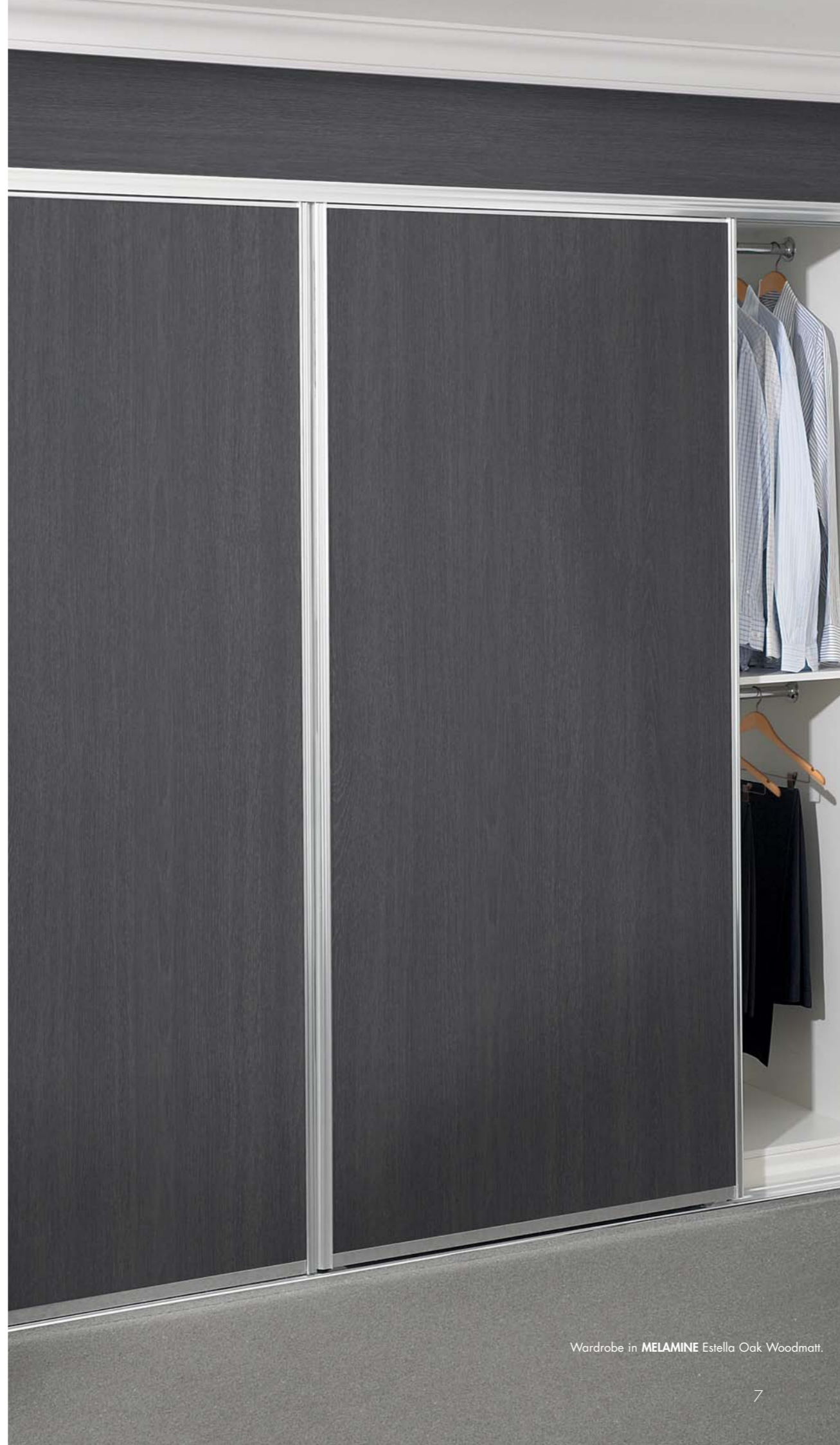
Wardrobe in MELAMINE Estella Oak Woodmatt.

Available finishes M = Matt S = Sheen A = Ashgrain