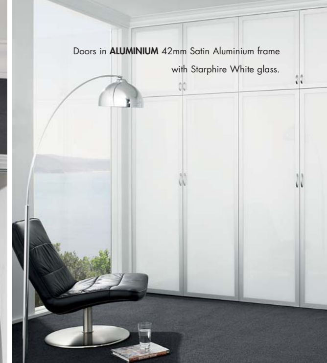
Doors in ALUMINIUM 42mm Satin Aluminium frame with Starphire White glass.